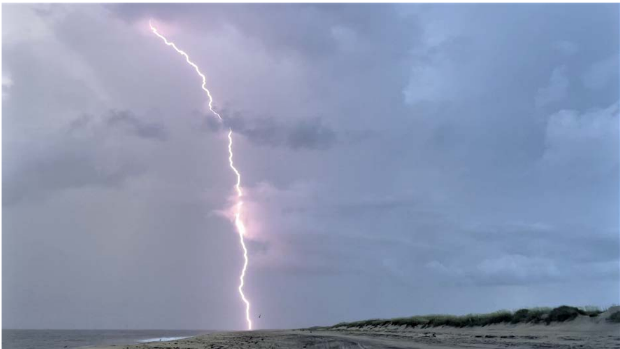
Lightning strikes on the beach of Cape Hatteras National Seashore.

The report underscores that “these widespread, diverse threats highlight not only the need for coordinated evaluation of vulnerabilities from multiple perspectives, but also the need for park managers to evaluate and plan for potentially irreversible ecological changes to the landscapes and resources that parks are intended to preserve.”