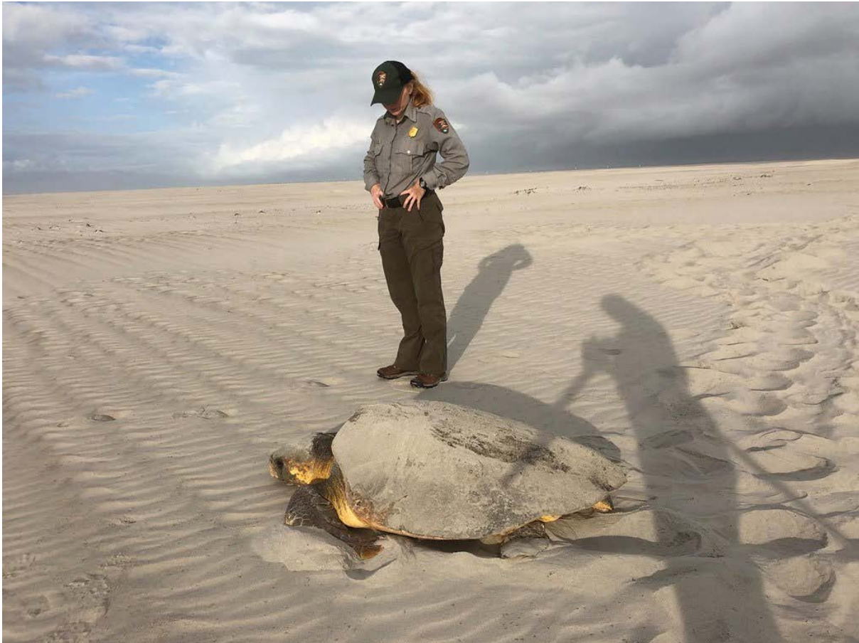
An NPS Biological Technician observes a day nesting loggerhead sea turtle on Ocracoke Island.

hatchlings. Monitoring nesting turtles also allows scientists to understand how temperature affects hatchling sex ratios. Typically, cooler temperatures lend to more males and warmer temperatures produce more females. This is especially important to understand as ocean temperatures increase due to climate change.