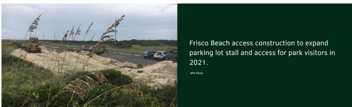
Frisco Beach access construction to expand parking lot stall and access for park visitors in 2021.

At Cape Hatteras National Seashore, the estimated cost of deferred maintenance is $183 million for existing buildings, roads, water systems, campgrounds, housing, and trails that, if left untouched, will fall into further disrepair. Many of these deferred maintenance needs are tied to impacts of climate change.