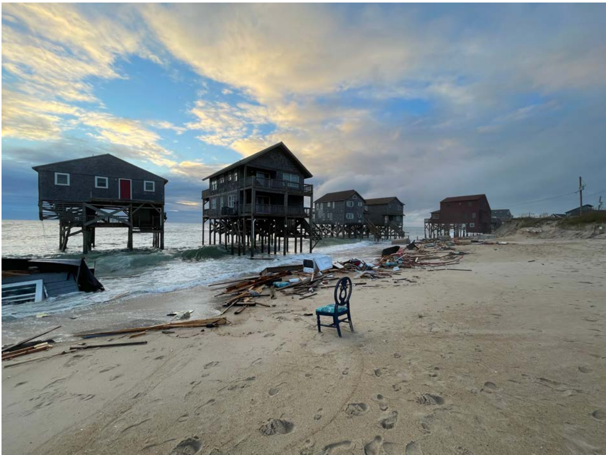
Debris along Cape Hatteras National Seashore from a home that collapsed in Rodanthe, NC in 2024.