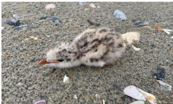
A gull-billed tern chick within the colonial waterbird colony on Ocracoke Island, Cape Hatteras National Seashore.

Critical habitat for protected species depends on the processes of Cape Hatteras' dynamic barrier islands for their survival. As shared in the park's significance statements , "the seashore supports resident and seasonal populations of federally listed and state-listed plants and animals including species such as the piping plover, American oystercatcher, gull-billed tern, green sea turtles, loggerhead sea turtles, and seabeach amaranth."