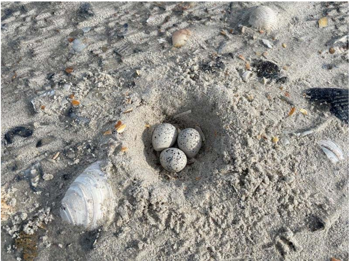
The first piping plover nest of the season was found on Ocracoke Island.

As a result of balancing recreational access and protection for wildlife, monitoring goes hand in hand with the NPS Off Road Vehicle (ORV) Management Plan completed in 2012. The ORV plan informs how park management provides safe beach access for visitors while also ensuring the protection of wildlife. This management is especially critical during nesting season for endangered species and other wildlife on the seashore.