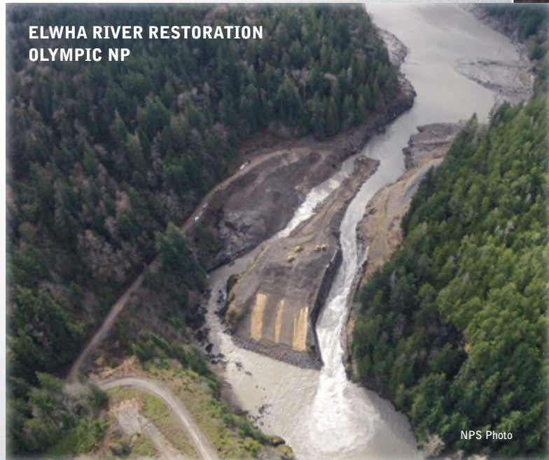
ELWHA RIVER RESTORATION OLYMPIC NP