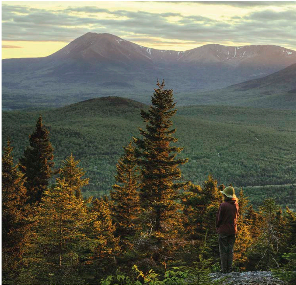
Katahdin Woods and Waters National Monument in Maine could be reduced in size or rescinded.