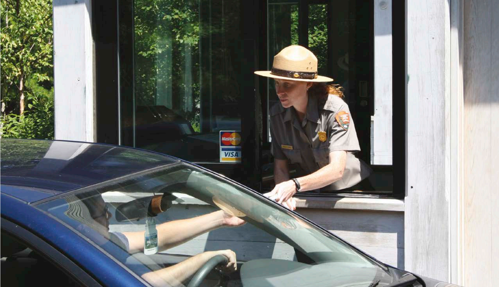
Under the proposal, entrance fees at the 17 largest national parks would be raised to $70 per vehicle.