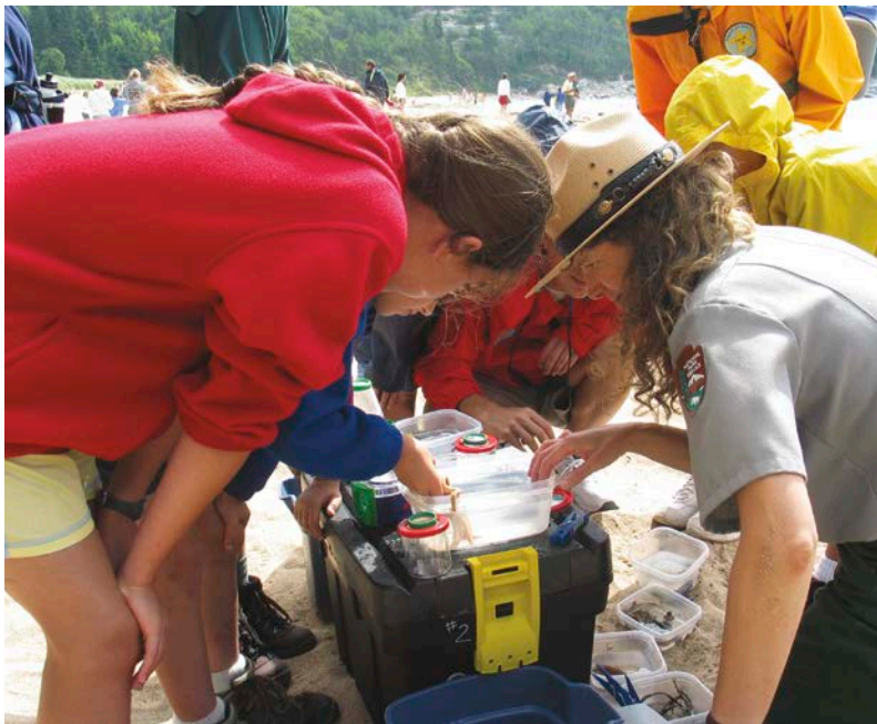
The Coalition objected to Secretary Zinke’s statement that 30% of Interior employees were not “loyal to the flag.”

NPS workforce reflective of the strength and diversity of America; ensure supervisors and managers receive necessary fundamental training and development; provide employees with overall mission and purpose training; review the NPS organizational structure, particularly the past consolidation of specialty functions at the Central Office level, which has proven counterproductive to parks; ensure zero tolerance when dealing with misconduct and poor performance of employees at any level within the organization; and ensure the senior leadership of the NPS is setting the example of effective leadership in protecting park resources and