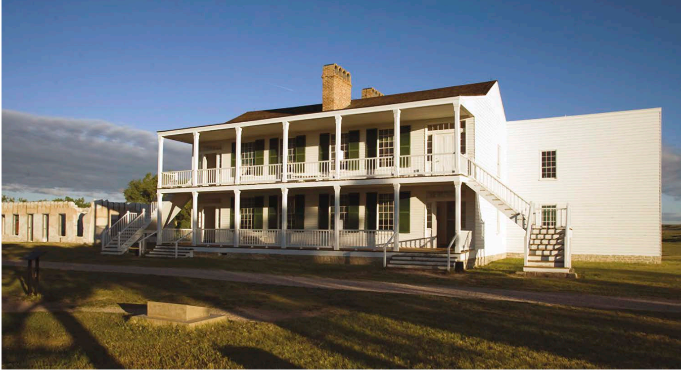
“Old Bedlam,” the first building constructed at Fort Laramie National Historic site in 1849.