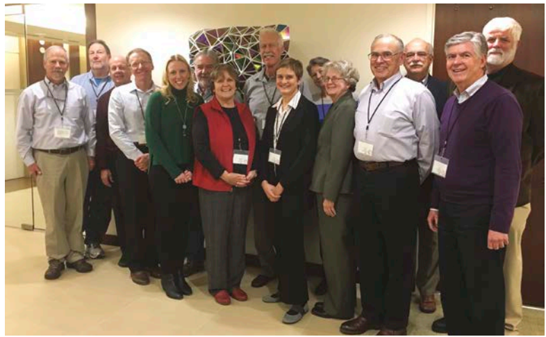
Coalition members and staff gathered in December 2017 for their annual meeting in Washington, DC.