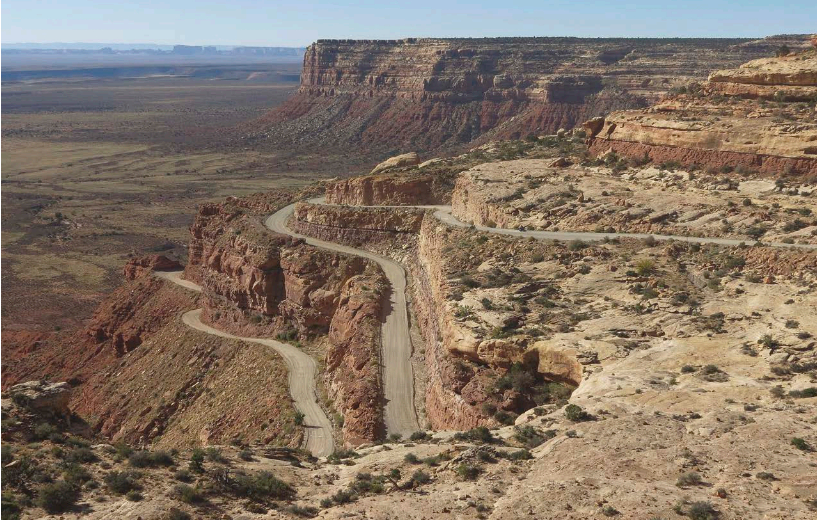
The Moki Dugway, located just northwest of the Valley of the Gods, was gouged out by a mining company in 1958 to transport uranium ore to Mexican Hat.