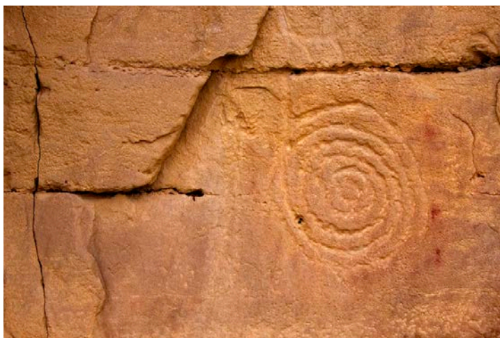
Top: Cutthroat Unit at Hovenweep National Monument. Bottom: A spiral petroglyph at Chaco Culture National Historical Park.